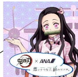
Right side of aircraft